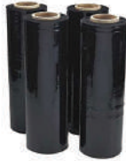
Black Shrink Wrap