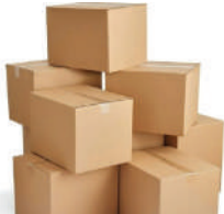
Carton Boxes All Sizes